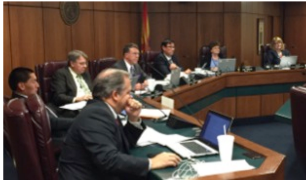
Arizona State Senate Committee on Financial Institutions